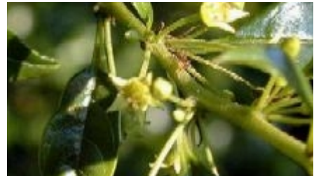
Small inconspicuous greenish flowers are borne on slender stalks in sparse, axillary groups or clusters of 2-10 flowers. Flowering occurs throughout the year and the flowers are sought after by bees. (Ellis RP)