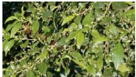
Very glossy dark green foliage on very dense, thick bushy tree, shrub or scrambler. (Ellis RP)