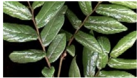
Dogwood leaves showing dark green and very shiny upper surface. Leaf stalks subtended by two, long, narrow stipules. Cultivated as a garden shrub. (Van Staden JM)

Flowering period in southern Africa is between October and December, and fruiting occurs from January to March. Flowers are popular with bees, which probably pollinate them. Fowls eat the fruit and most likely disperse the seeds.