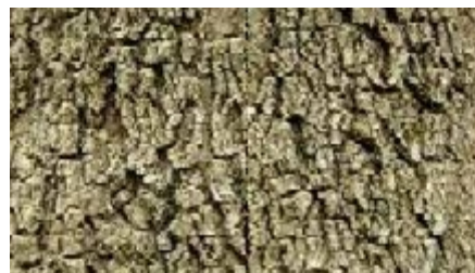
Bark