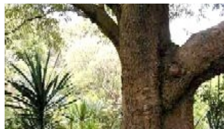
Trunk tall, erect, sometimes somewhat fluted. (Ellis RP)

In Tanzania flowering occurs during the long rains, extending into the dry season up to the onset of the short rains; fruit ripens during the dry season extending into the short rainy season up to the long dry season. In South Africa flowering is from May to October and fruiting from October to March. It takes about 9-10 months between fertilization of the bisexual flowers and ripening of the fruit.