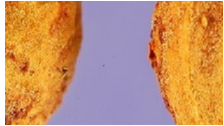
seeds (Tracey Slotta @ USDA-NRCS PLANTS Database)

Blackthorn flowers from late February to April and the fruits (sloes) ripen in September to October. The flowers are hermaphrodite and are insect pollinated. The pistils are ripe before the stamens, so self-fertilization is avoided.