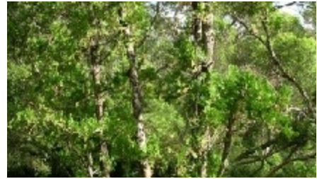
Trees at Waikamoi trail, Maui, Hawaii.

Seed bearing starts at 3 years for instance in Kazakhstan.