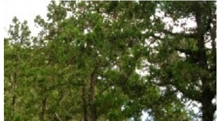
Branch at Waikamoi trail, Maui, Hawaii.