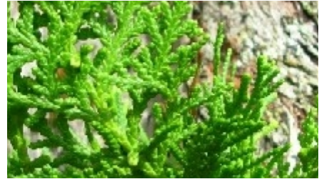
Leaves at Waikamoi trail, Maui, Hawaii.