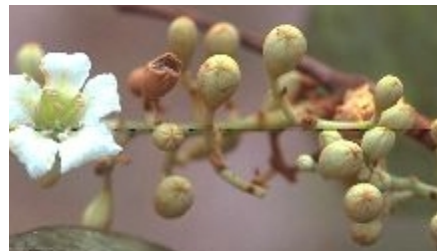
Piliostigma thonningii flowering shoot.