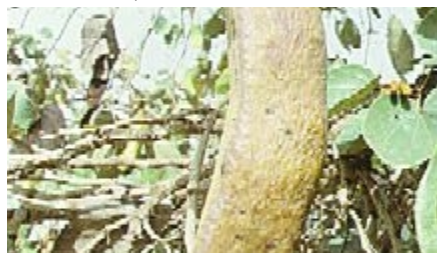
Piliostigma thonningii young pods