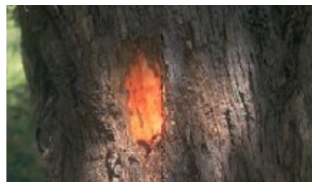
Piliostigma thonningii slash (Joris de Wolf, Patrick Van Damme, Diego Van Meersschaut)

A dioecious tree with male and female flowers on different trees. The off-white to pink fragrant flowers appear from November to March in many flowered hanging sprays. The female flowers are superseded from May to September by the large dark red-brown flattened oblong pods. The pods sometimes break up into one-seeded pieces after falling from the tree. The tree becomes nearly leafless in the dry season.