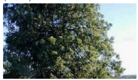
A striking medium sized to large, semievergreen tree 12-20m tall. It has a short, thick bole and a massively branched, rounded crown. Native to South America (Argentina, Uruguay, Paraguay, Brazil and Peru). Widely cultivated in South Africa for fodder and shade, wherever frost is not too severe. (Ellis RP)