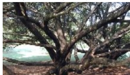
The unusual branching pattern as seen from inside the canopy. (Ellis RP)