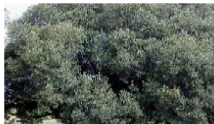
Typical growth form of the wild olive in the Pretoria area - dense, rounded crown with spreading branches. This tree occurs throughout South Africa in a variety of habitats and displays a number of growth forms from multi-stemmed shrubs to stately trees up to 18m tall. (Ellis RP)

In its native range the fruits typically ripen in September, towards the end of the rainy season. Usually only 1 ovule is fertilized.