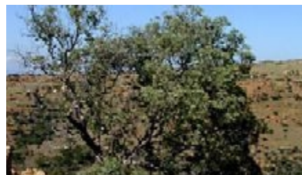
A rounded evergreen shrub or small tree. A widespread species, here growing in exposed conditions. (Ellis RP)

N. congesta is monoecious, flower buds appear in autumn and develop slowly before blooming.