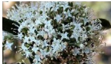
A shrub or medium-sized evergreen tree. The flowers are in dense, congested terminal heads, small, white and fragrant. (Botha AD)