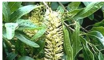
Flowers and foliage

Pollination is by insects; most cultivars are at least partly self-incompatible. Planting pollinator trees and introducing bees are important for good fruit set. Fruitlets continue to be shed up to 2 months after bloom.