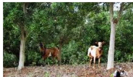
Goats are used to graze under macadamia nut trees where they control weeds without doing much damage to the trees or the hard nuts which fall to the ground when mature. (Craig Elevitch)