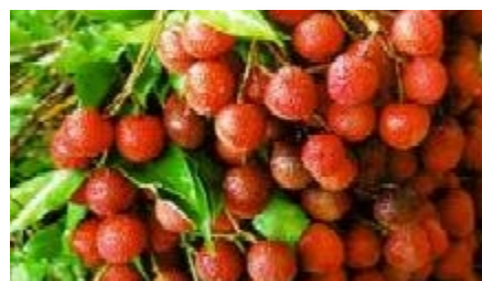
Lychee in the market.