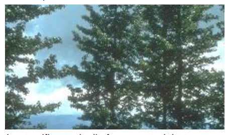
L. straciflua typically forms a straight tree with a narrow crown and light branching, as here on the Sierra de Omoa, northern Honduras. (Colin E. Hughes)