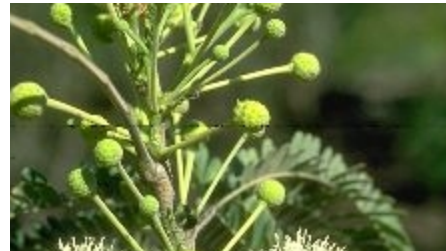
Flower heads of L. salvadorensis.