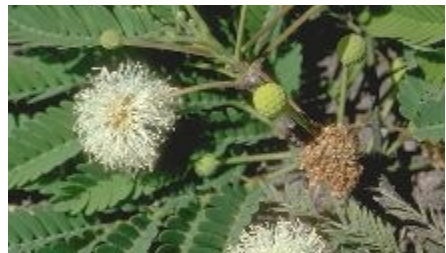
The unripe pods of L. salvadorensis are tough and leathery taking 10 months to ripen compared to the generally more papery, quickly ripening pods of most species of Leucaena . (Colin E. Hughes)