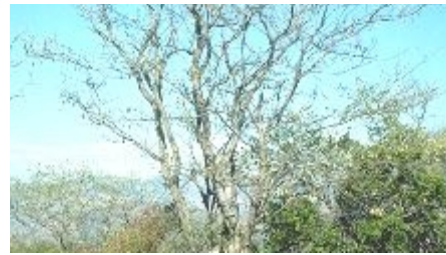
Mature tree of L. salvadorensis near San Juan de Limay, Esteli, northern Nicaragua in full flower and leafless at the peak of the dry season.

The precise time required for pod ripening is unknown. However, it is suspected that pods take approximately 10-11 months to ripen.