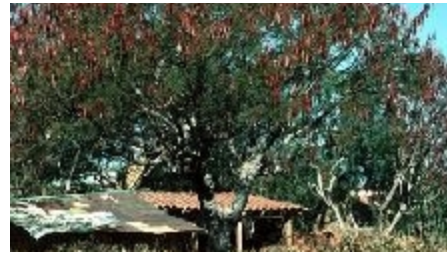
Mature tree: Etna, Oaxaca, south-central Mexico. (Colin Hughes)