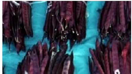
Group of trees: Tehuacan Valley, Puebla, south-central Mexico. (Colin Hughes)