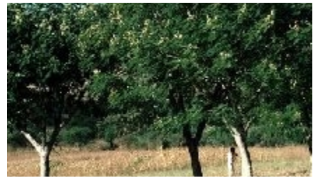
Mature tree: Etna, Oaxaca, south-central Mexico. (Colin Hughes)

The main flowering period is between October and November, while fruiting follows between February and March. Trees are deciduous, losing most or all of the leaves during the dry season from January to April in the species natural range.