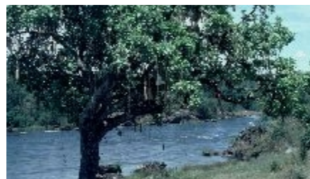
K. pinnata in Kabalega Falls National Park, Uganda.

Bats pollinate the bisexual flowers of K. africana . In South Africa, flowering occurs from August to October and fruiting from December to June.