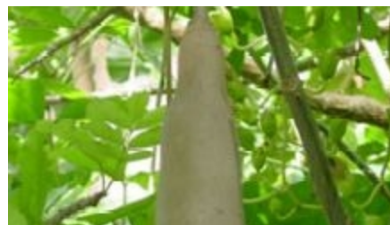
Fruit (Trade winds fruit)