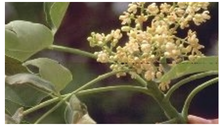
Khaya senegalensis flower

K. senegalensis is insect pollinated. Flowering shortly before or early in the rainy season, the fruit apparently remaining on the tree throughout the dry season. When the fruit ripens, the colour changes from grey to black. Begins to bear seed when the tree is 20-25 years old. Seed may be dispersed up to 100 m by prevailing winds.