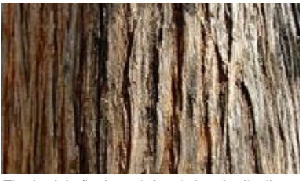
The bark is finely and deeply longitudinally grooved. Peels with age. (Ellis RP)