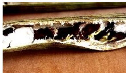
Inga edulis : Inga edulis fruits sold by the side of the road in Iquitos city, Peru. (Soraya Alvarenga Botelho)