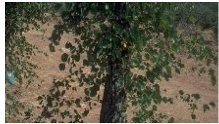
Typical "epicormic" branching habit of H. binata which permits limited lopping from the trunk for livestock fodder. (Colin E. Hughes)

In India, the tree is leafless, or nearly so, for a short time towards the end of the cold season, the new leaves, which are tinged with red, appearing in April. The trees are in leaf in the hot weather, and their feathery foliage is conspicuous when most other species are leafless. The light, winged pods commence falling in early May and are often carried some distance from the mother tree, the strong winds being prevalent in that season. There is some sporadic seeding every year, but gregarious seeding takes place on average every 3-5 years, according to locality.