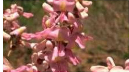
Flowers in seed orchard, Honduras (Anthony Simons)