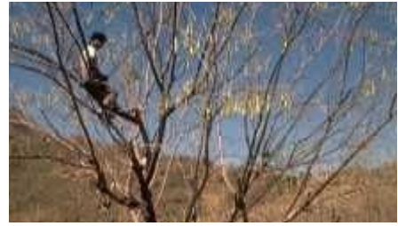
Seed collection in La Garita, Honduras (Anthony Simons)

Pod-ripening time ranges between 35 and 60 days. Pods can grow to full size within 3 weeks of fertilization. On maturity, pods dehisce explosively; tension builds up in the pod valves and the seeds are ejected to a distance of 25 m. This phenomenon facilitates rapid establishment, especially in disturbed sites. Wind plays a part in the direction of seed dispersal. Secondary dispersal by rain is also possible.