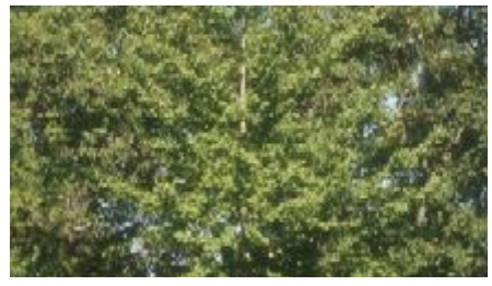
habit (Tamara Crupi, September 1996)