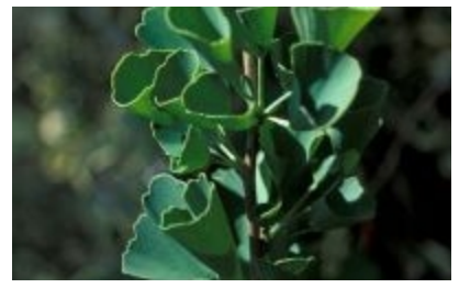
Leaves at Kula Experiment Station, Maui, Hawaii (Forest and Kim Starr)

The maidenhair tree is dioecious. A strong correlation is observed between blooming dates and meteorological factors, an increment of 1-3 deg C in monthly mean temperature enhances Ginkgo blooming in Japan. Ginkgo seeds contained well-developed embryos at the time of dispersal. Sex differentiation in Ginkgo is controlled by the balance of endogenous gibberellic acid (GA3) ethylene and cytokinins. The prevalence of GA3 is beneficial for male sex expression.