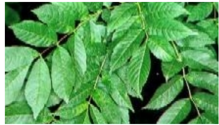
Compound leaves. (Arnoldo Mondadori Editore SpA)