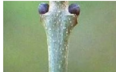
Detail of buds. (Anderberg A. (Den virtuella floran))