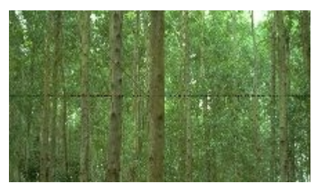
E. urophylla, 6 year old provenance trial, San Carlos, Costa Rica. (David Boshier)

Flowering usually starts within 2 years from planting. The bisexual flowers are open to many pollen vectors such as insects, birds or small mammals. Some wind pollination is also possible. There is a capacity for selfing if outcrossing fails. This is an evolutionary advantage in the survival of the populations.