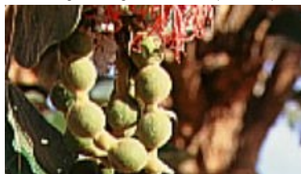
Detail of the unusual "petals" which characterize this species. (Ellis RP)