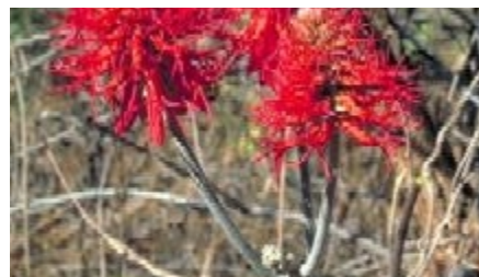
Flowers (Saunders R.C.)

In southern Africa, flowering occurs from July to November, and fruiting from November to March. In Zambia, flowering occurs before the new leaves appear from July to October, and pods appear between December and March. Flowers often appear on a bare tree. Pollination is by nectar-feeding birds. Seeds mature within 60 days of pollination, and they are dispersed by fruit-eating birds that mistake them for ripe berries.