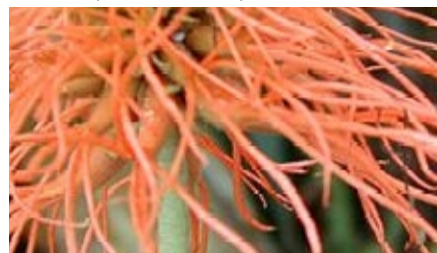
The calyx lobes are long and filamentous and a bright orange-red colour. (Ellis RP)