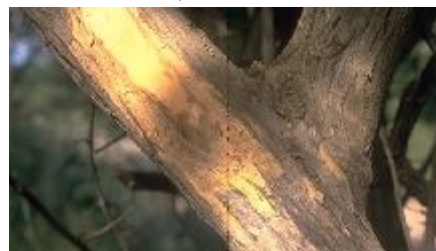
Dichrostachys cinerea bark.