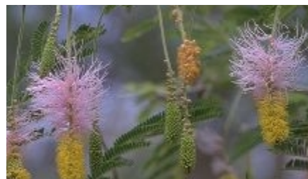
Dichrostachys cinerea flowering branch. (Joris de Wolf, Patrick Van Damme, Diego Van Meersschaut)

In Indonesia, D. cinerea has been found flowering from September to June and fruiting from March to May, sporadically in other months; in southern Africa flowering is from October to February and fruiting from May to September. The structure of the inflorescence suggests pollination by bats. The infructescence has a strong aroma, which probably attracts animals to feed on the pods. A fraction of seeds exhibit polyembryony with usually 2, sometimes 3, or rarely more embryos; the extent of polyembryony seems to be positively correlated with the number of seed produced.