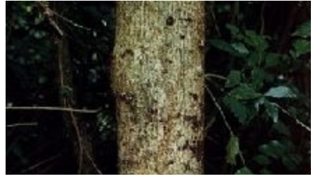
Trunk of Croton tree: Trunk of a 10-year-old C. megalocarpus tree in Muguga 25 km NW of Nairobi, Kenya. The bark is pale grey and starting to show longitudinally fissured lines. (Phanuel O. Oballa)