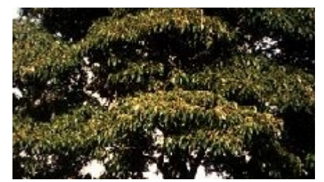
Croton tree: A 15-year-old C. megalocarpus tree at a site in Bondo District, western Kenya. The tree is approximately 12 m tall and 15 cm in diameter. Note the clear arrangement of branches in the canopy to form a mosaic. (Phanuel O. Oballa)