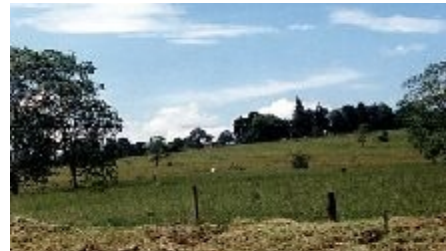
Shade trees: C. macrostachyus shade trees in pastureland, Kakuzi, Kenya. (Paul K.A. Konuche)