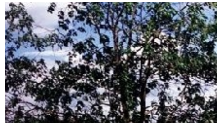
C. macrostachyus : A representative tree at Kakuzi Ranch, Kenya.

In Kenya, flowering is observed in Kakamega District in March and April; in Nyeri, Meru and Kericho Districts in June and July; and in Pokot District in August and September. In Nigeria, flowering occurs in March to May and fruiting from January to March. After pollination by insects, fruit development takes 3-5 months.