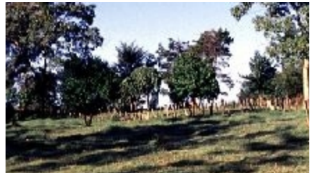
Pure stand: C. macrostachyus growing as a pure stand at Kakuzi Ranch, Kenya. (Paul K.A. Konuche)