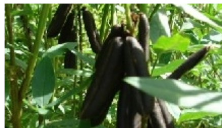
Fruit at Ulumalu Haiku, Maui, Hawaii.