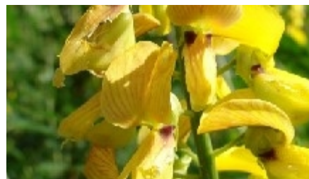
Flowers at Ulumalu Haiku, Maui, Hawaii.

C. trichotoma flowers are believed to be pollinated by insects before they open, suggesting cleistogamy and self-incompatibility.