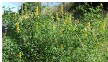
Branch with flowers and pods at Haiku, Maui, Hawaii.