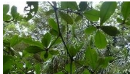
Habit at Keanae arboretum, Maui, Hawaii