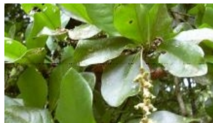
Flowers at Keanae arboretum, Maui, Hawaii

Flowering occurs throughout the year in Puerto Rico and in Florida it takes place in spring. Flowers may be staminate or perfect. Fruits mature in about 3 months, are light, easily blown away by strong winds and float on water.