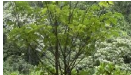
Habit at Keanae Arboretum Maui, Hawaii