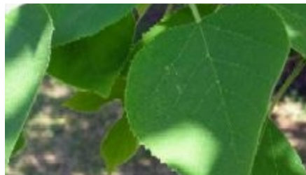
Foliage and fruits at Strybing Arboretum, Golden Gate Park, San Francisco, CA (J.S. Peterson @ USDA-NRCS PLANTS Database)