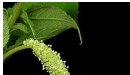
Male inflorescences

In India, leaves are shed between September and January and the new leaves appear in February or March. On average, B. papyrifera trees are leafless for 1-3 months. The flowers appear in March-April. The fruit ripens in the rainy season from July to September. Seed dispersed by birds.