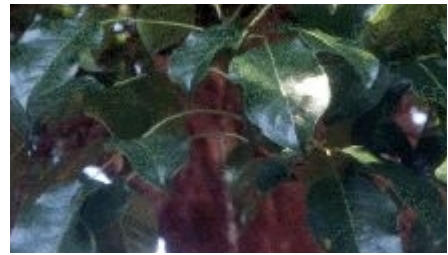
Bischofia javanica Foliage (Rafael T. Cadiz)