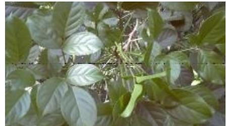
Habit at Deering park, Florida