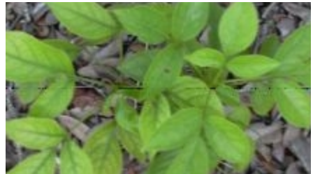
Habit at Deering park, Florida