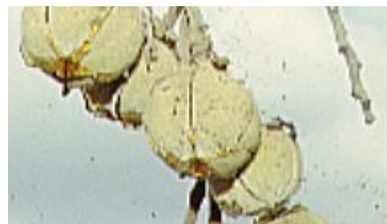
Azanza garckeana (Patrick Maundu)

Flowering takes place during the rainy season; fruit ripening occurs during the dry season. It takes about 6 months from flower fertilization to fruit ripening. In southern Africa, flowering occurs from December to May and fruiting from February to September.