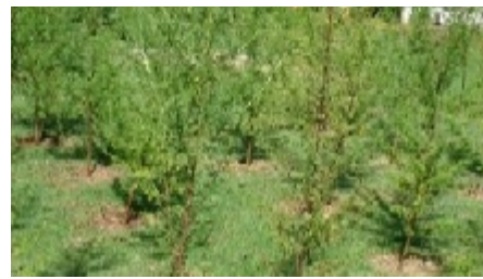
Seven month old Artemisia annua at the ICRAF campus (AFT team)