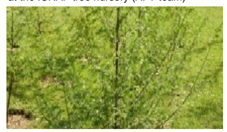
Seven month old Artemisia annua at the ICRAF campus (AFT team)