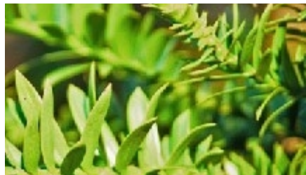
tree