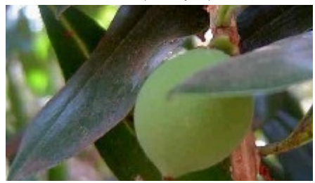
Fruit (Bart Wursten)