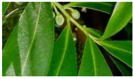
Flowers and leaves (MA Hyde)

Insects pollinate the bisexual flowers and birds disperse the fruit. In South Africa, flowering time is from April to May and fruiting from October to January.