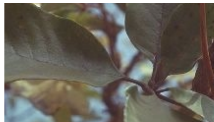
Vitex doniana foliage