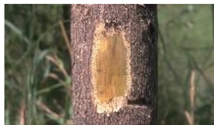
Vitex doniana slash