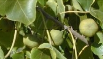
Fruits and leaves at Kanaha beach, Maui, Hawaii (Forest and Kim Starr)

Trees flower and fruit throughout the year. The yellow flowers open about mid-morning, turning reddish-orange in the afternoon, then fading to pink on the tree and not falling off for several days. Pollination is probably by birds. The seed floats in sea water, making natural distribution by sea currents possible.