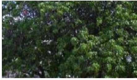
Habit at Kahului, Maui, Hawaii