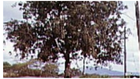
Terminalia brownii (Patrick Maundu)

In Sudan trees flower from April to June, and fruiting occurs from October to November. In Kenya, trees flower in years with normal climatic conditions from March to June. After pollination by insects, fruit development takes about 5-6 months.