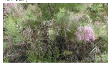
Flowers at LZ1 Kahoolawe, Hawaii