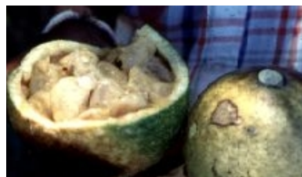
Strychnos spinosa fruits

'Strychnos', meaning 'deadly', is an ancient Greek name that was given to a certain poisonous member of the Solanaceae family. Linnaeus, who founded the genus Strychnos on the Indian species which yields strychnine, S. nux-vomica , possibly associated the deadly qualities of both groups when he named the genus. The specific name 'spinosa' is Latin for spiny.