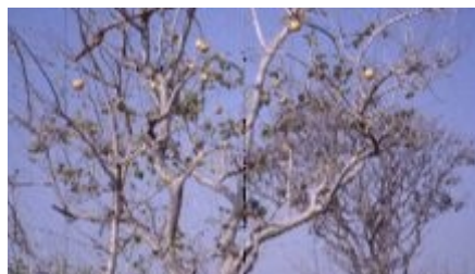
Strychnos spinosa foliage