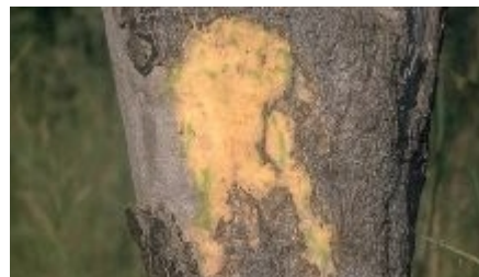
Strychnos spinosa slash