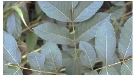
Stereospermum kunthianum foliage