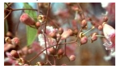
Stereospermum kunthianum flowers