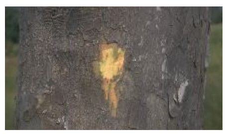
Stereospermum kunthianum

In Zambia, the bisexual flowers appear in the dry season before the new leaves, between August and October, and pods ripen between October and December.