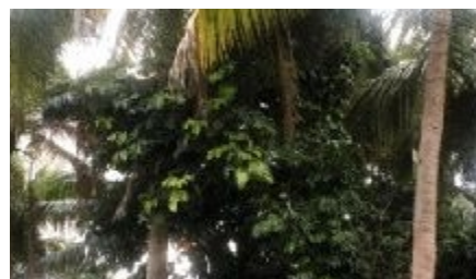
Tree habit: Tree planted as understory in a coconut plantation. (Rafael T. Cadiz)

Santol is a hermaphroditic tree flowering after 5-7 years (clonally propagated trees may flower after 3-4 years). Pollination is by insects. Flowers annually and in Peninsular Malaysia the flowering period is so reliable in its timing that it was formerly the signal for the planting of rice. New leaves develop rapidly and flowers appear shortly after the development of new shoots. Fruit maturation takes about 5 months. In the Philippines ripe fruits are present from June-October, and in Thailand from May-July. Bats disperse the seeds.