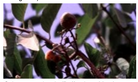
Saba senegalensis