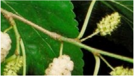
Leaves and fruits. (Arnoldo Mondadori Editore SpA)

Flowers are normally bisexual but can be unisexual on different branches of the same plant. Both types appear in stalked, axillary, pendulous catkins in April and May. Fruit ripens and drops off the tree from June to August; water, birds, jackals and human beings often disperse it.