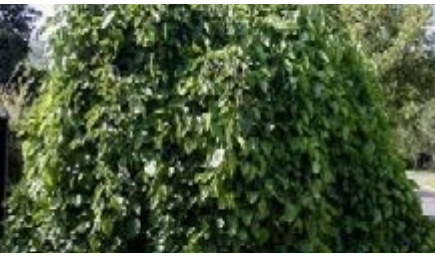
Pakistan Forest Institute mulberry plantation. (Boner A.)