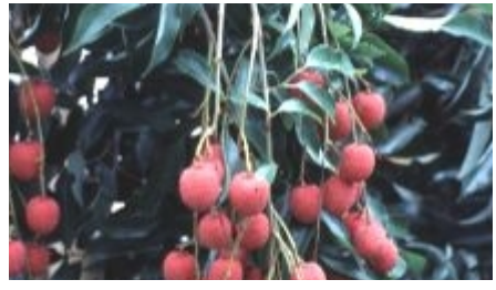
Litchi chinensis (Chongrak Wachrinrat)