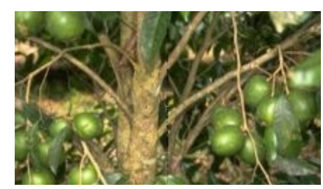
Fruit on three-year-old trees in Onne, Nigeria