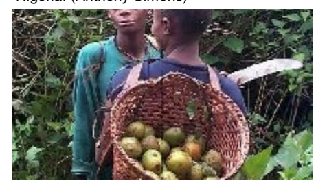
Kernels (centre) from fruits in Cameroon