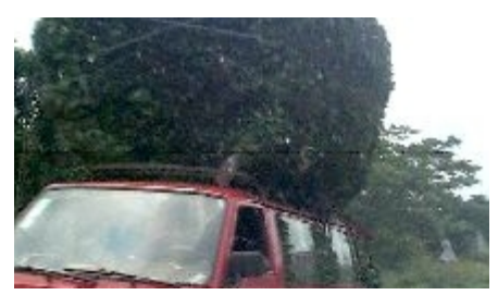
Gnetum africanum leaves (commercialization) (Ebenezer Asaah)

G. africanum continues to grow during the dry season and new shoots may develop where the stem has been cut or where side shoots have been removed. New shoots are also formed from rhizomes that spread along the forest floor. The distinctly coloured drupe-like seeds are probably dispersed by birds and other animals.