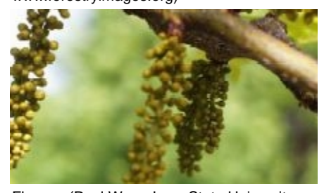
Flowers