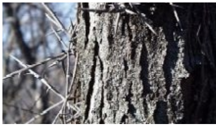
Bark

Grafted seedlings begin to bear pods after 3 years and within 8 years will produce a dry weight of pods of 20-75 kg/tree. In the southern United States, the bee-pollinated flowers appear from early May and to late June in the north. Mature pods begin to drop by mid-September and continue throughout the winter. Seeds ripen from mid- September to late October in the United States.