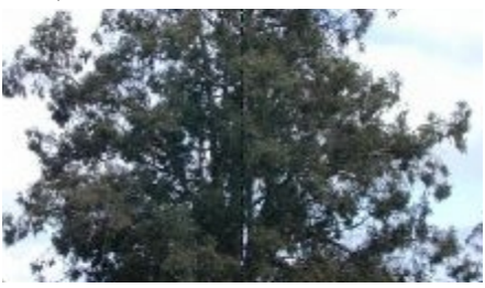
Habit at Kula, Maui, Hawaii