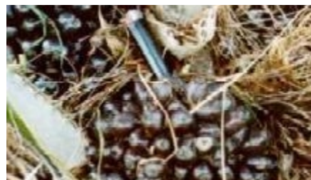
Friendly Farm - fruits 6 weeks from maturity; Luapula province. (Griffee P.)