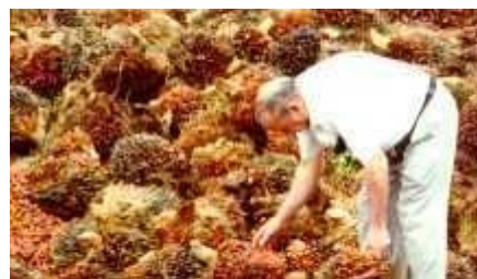
Processed fruit bunches for industrial use in distillation of ylang flowers. Sikense, Ivory Coast. (Griffee P.)

Male and female flowers are borne on the same plant but open at different times, so that cross-pollination is necessary. A male inflorescence contains 700-1200 flowers and may yield 80 g of pollen over a 5-day period. The female flower is larger and receptive to pollen for 36-48 hours. Honeybees are attracted by the pollen scented like anise seed, which they collect as they gather nectar. It has not been established whether the bees contribute to pollination. However, The weevil Elaeodobius kamerunicus has been found to be a successful pollinator. Fruit development commences immediately after fertilization. Black vultures ( Coragyp atratus ) feed avidly on E. guineensis and are involved in its dispersal.