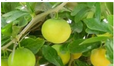
The fruits are round and fleshy, up to 40mm in diameter and orange-yellow when ripe. The fruit is edible and makes an excellent jam. (Ellis RP)